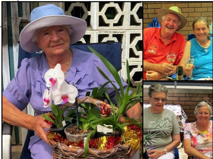
At the Christmas Party